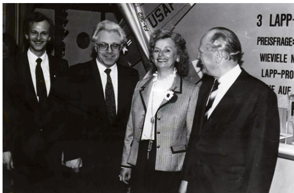
Hannover Fair 1982